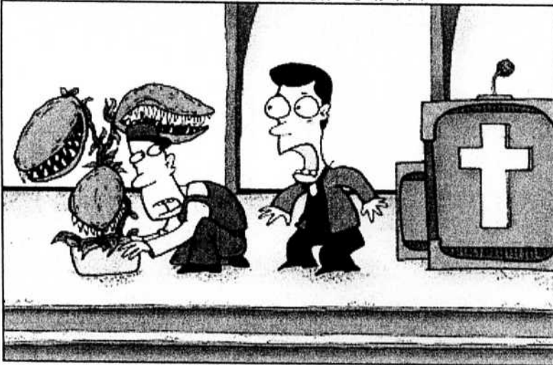
Father Tom asked Chick for something new and exciting for altar flowers but somehow this was not it!!!