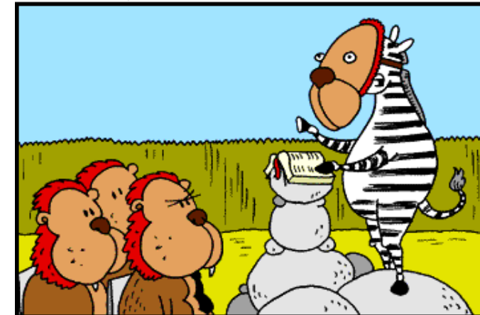
(See Exodus 20:1-21) 12-13-1999

WE ARE GOING TO FOCUS THE SERMON AGAIN THIS WEEK ON THE MOST IMPORTANT COMMANDMENT ... THOU SHALT NOT KILL