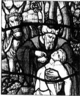
The Good Samaritan Luke 10: 25-37

Over 35 St. Rita groups provide opportunities to share your, time talents and treasure supporting one another, our parish, local community and national organizations. There's something for everyone!