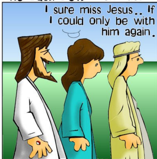
Jesus takes a post resurrection stroll 'incognito' on the road to Emmaus. Luke 24:13-35