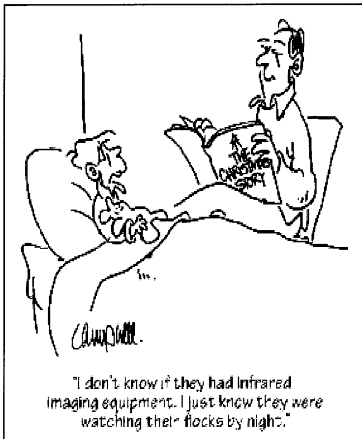
"I don't know if they had Infrared Imaging equipment. I just know they were watching their flocks by night."