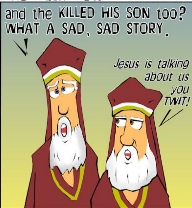
The parable of the landowner and tenants was lost on Phil the Pharisee. Mt 21:33-46